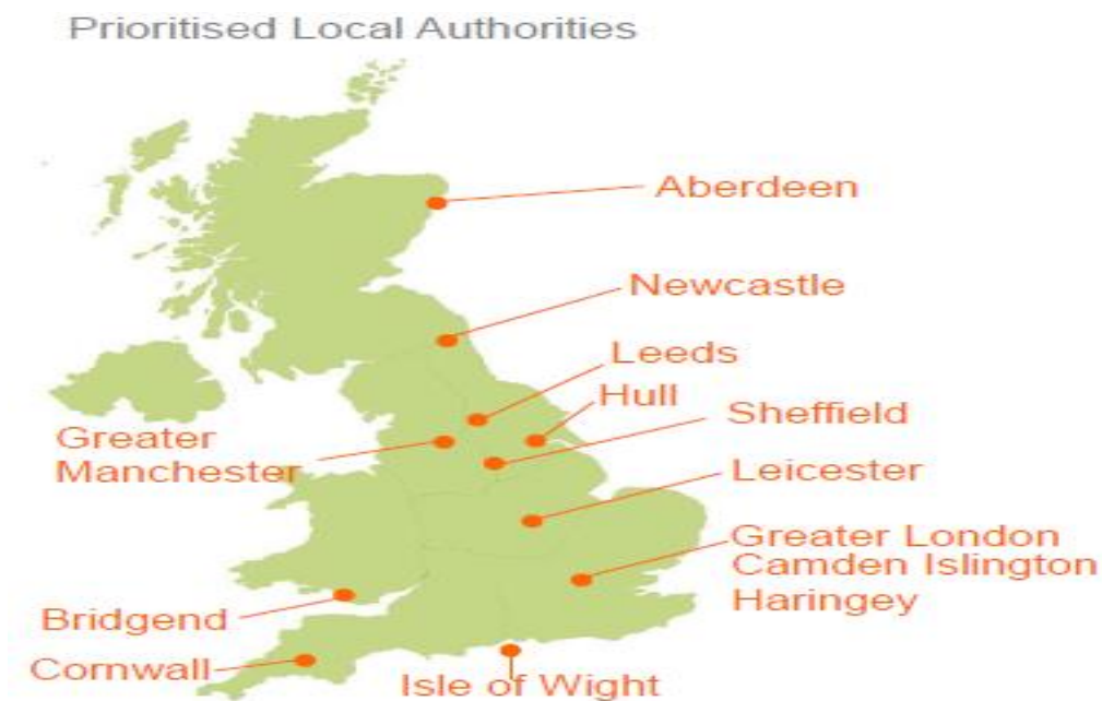
Figure 1 SSH Programme Prioritised Local Authorities

3.2 The next stage of the Programme required BCBC to submit a Request for Proposal (RfP) in June 2014 which was again scored and then used to select 3 local authorities from the prioritised 11. BCBC submitted a RfP and was selected as one of the three demonstrator authorities for the SSH Programme (Greater Manchester Combined Authority and Newcastle City Council were the other selected authorities). Cabinet authorised BCBC participation in the SSH Programme in a report presented on the 3 rd February 2015.